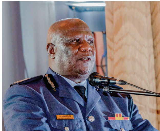
Mr Phemelo Ramakorwane Acting Commissioner of Police

"Increasingly, criminals continue to exploit the cyberspace to execute their criminal activities. This calls for law enforcement institutions to strengthen collaborations and invest more in law enforcement technology," The Minister said.