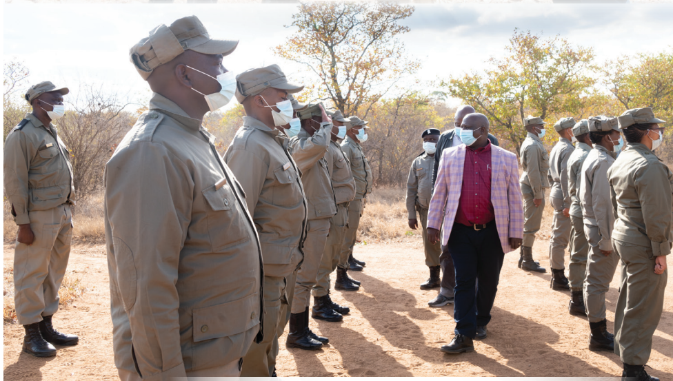
Commissioners inspecting a parade mounted by members of the Special Support Group at Mmamabaka Base Camp

called for development of programmes which would infuse them in the various crime prevention structures as that could help reduce their involvement in crime.