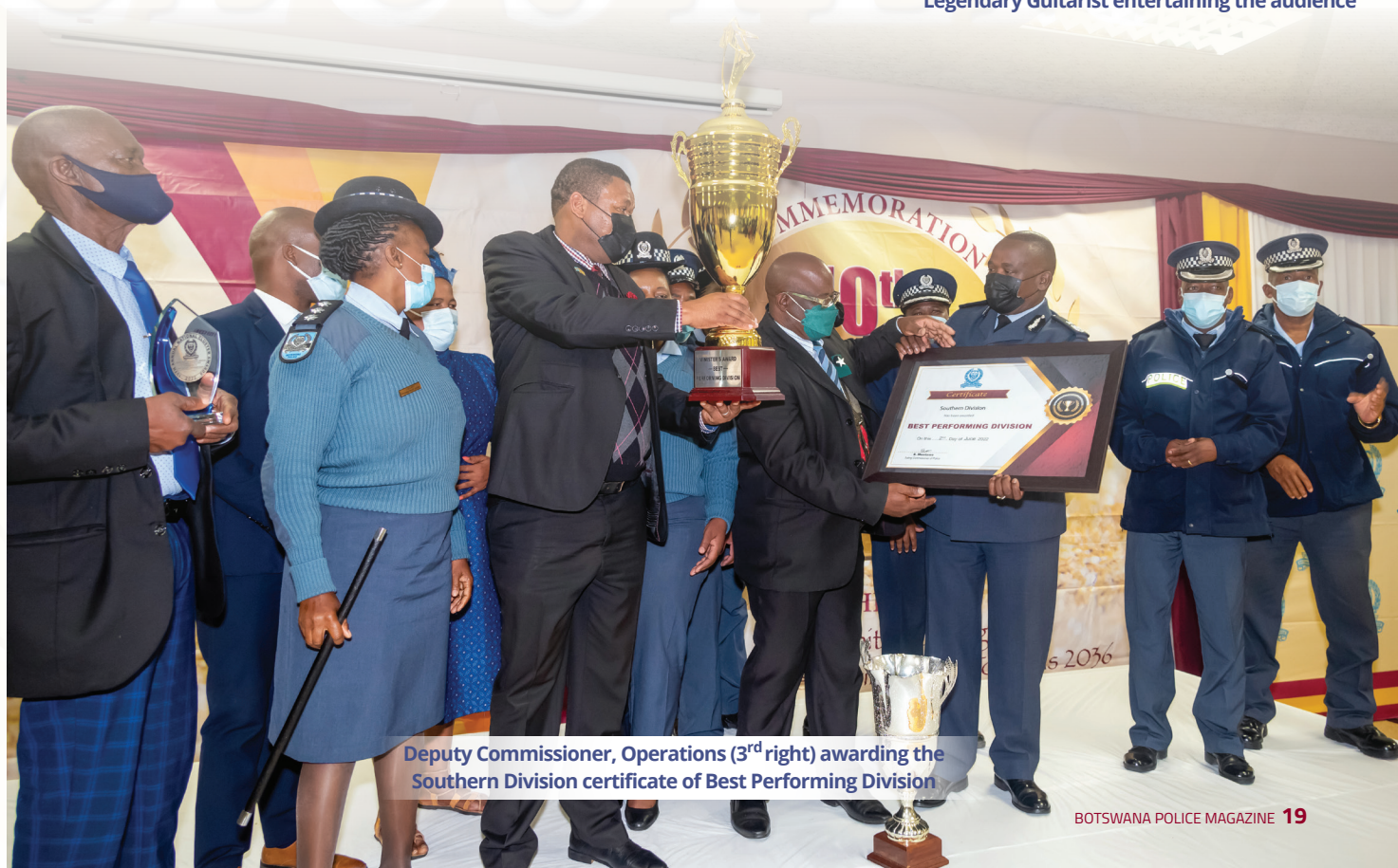
Deputy Commissioner, Operations (3 rd right) awarding the Southern Division certificate of Best Performing Division