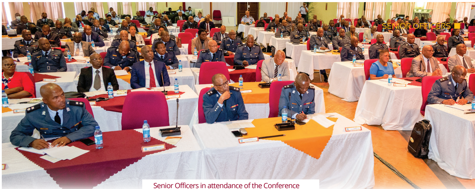
Senior Officers in attendance of the Conference

the would-be perpetrators as well as solicit justice for the victims.