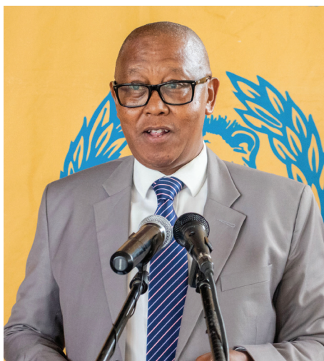
Hon. Thapelo Matsheka Member of Parliament For Lobatse

He said the report of the Convention recommended the establishment of such Centres and urged all member countries to take legislative,