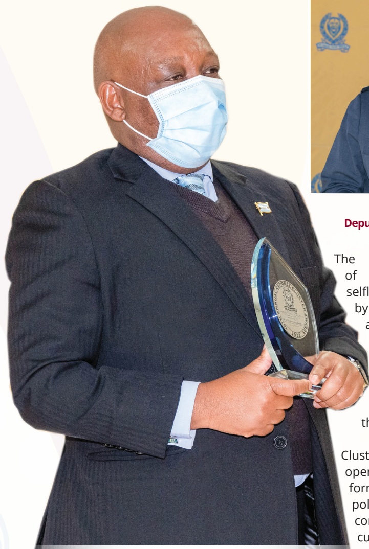
Honourable Thomas Kagiso Mmusi Minister of Defence and Security