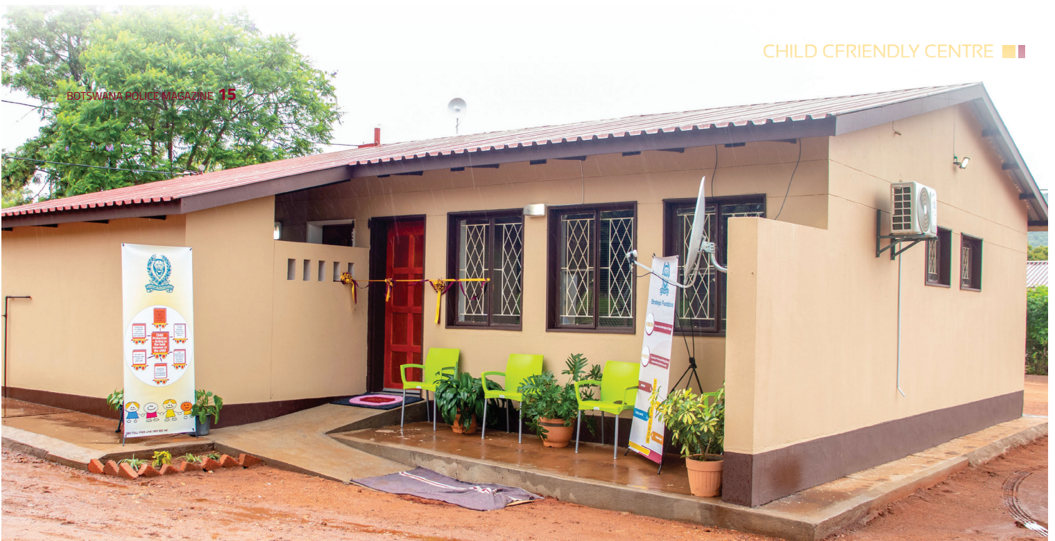
Child Friendly Centre in Lobatse

"Parents are the major stakeholders in these projects as they are the ones who should come forward to report issues of child abuse."