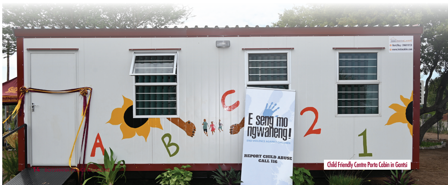
Child Friendly Centre Porta Cabin in Gantsi