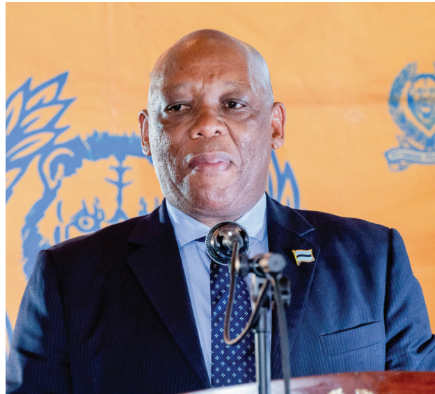
Hon. Thomas Kagiso Mmusi Minister of Defence & Security

When officiating at the event, the Minister of Defence and Security, Honourable Thomas Kagiso Mmusi said this year's theme highlights the need to address the challenges of policing in a digital age by adapting to the changing dynamics and complexities of law enforcement. He called on the participants to engage in a thorough and positive discussion that focused on creating effective methods for law enforcement in the modern era of technology.